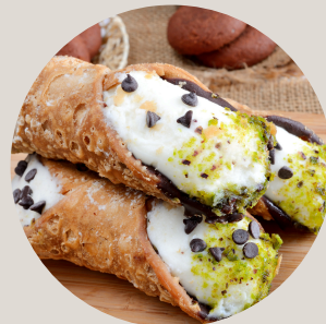
Cannolo Siciliano | 8