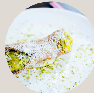
Cannolo al Pistacchio | 8