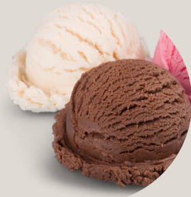
Trio of Ice Cream | 6.50

Vanilla, Strawberry/Raspberry, Chocolate (2,4,5)