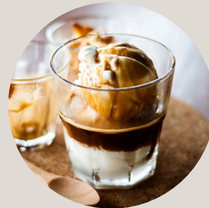
Affogato | 8

Vanilla, Strawberry/Raspberry, Chocolate (2,4,5)