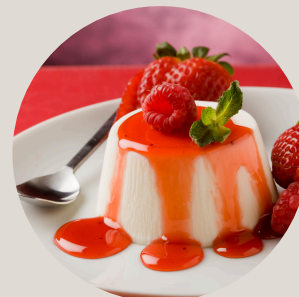
Homemade Panna Cotta | 8