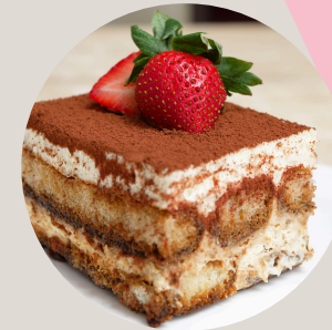
Homemade Tiramisu | 8