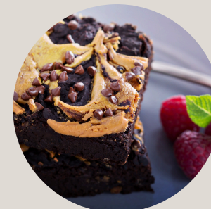
Homemade Chocolate & Peanut Butter Brownie | 8